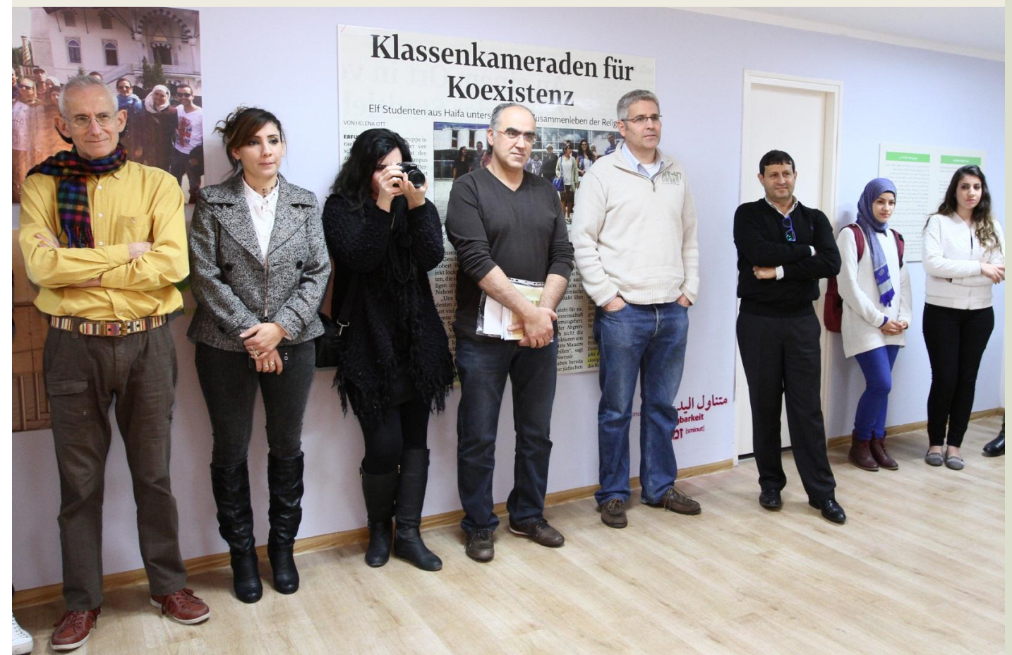
(below) Staff and participants listen to speakers at the launch.