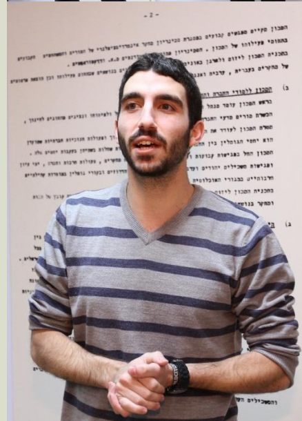
(right) the 'wall of language' that students and staff pass every day.